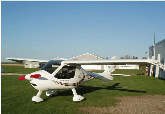
Flight Design CT Light Sport Aircraft available for training and for sale (Stanton is also a dealer for this LSA).